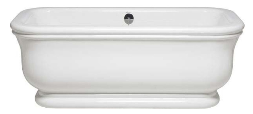
FOB: N. Hollywood, CA)

Always check the website for the most updated specifications: www.americh.com