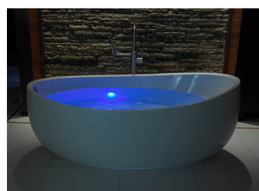
Chromatherapy-LED Lighting System