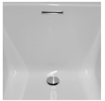
Linear Integral Waste and Overflow