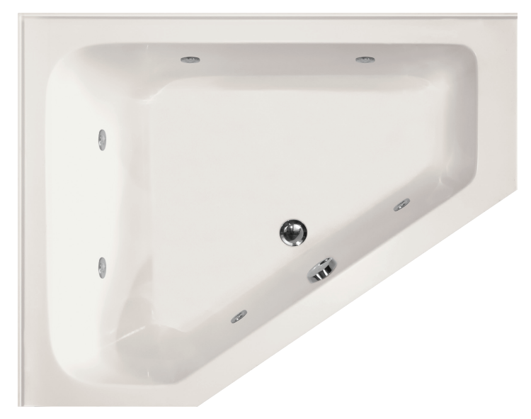
*Tub must be set in mortar base*