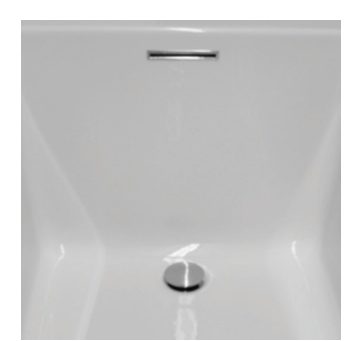
Linear Integral Waste and Overflow