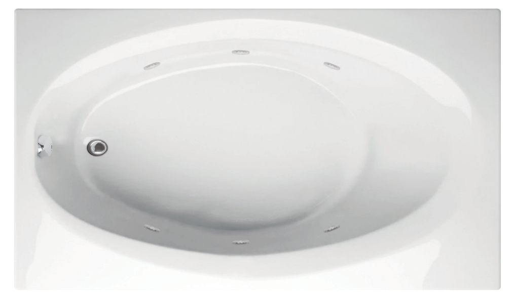
*Tub must be set in mortar base*