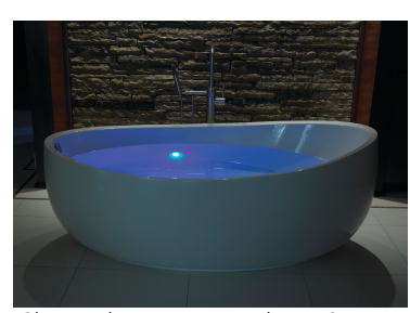
Chromatherapy-LED Lighting System