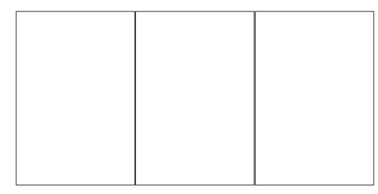
Ganging Cabinet-to-Cabinet Arrangement