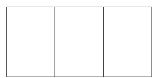
Ganging Cabinet-to-Cabinet Arrangement

Gangs to M Series Lighting - Reference Ganging kit for the particular light option when ordering